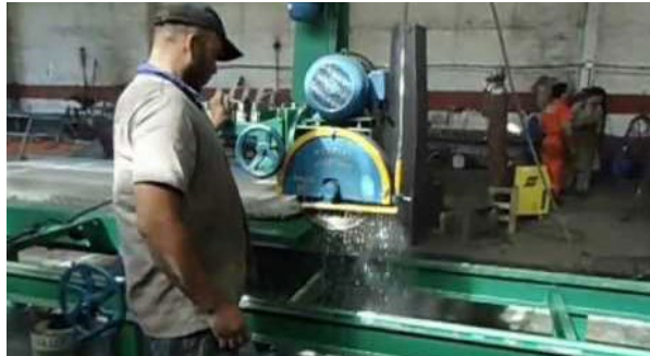
A worker cutting granite using a saw that applies water to the blade. The water reduces the amount of silica-containing dust that gets into the air.

In most cases, dust controls such as wet methods and ventilation can be used to limit workers' exposure to silica. These technologies are widely available, affordable and already commonly used by many employers.